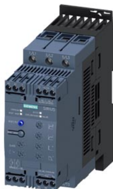
SIRIUS soft starter S2 72 A, 37 kW/400 V, 40 °C 200-480 V AC, 110-230 V AC/DC Screw terminals